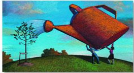
The Preceptor Difference

Clinical Placement Coordinators ECU College of Nursing Health Science Building Greenville, NC 27858