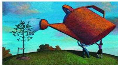
The Preceptor Difference

https://www.aacnnursing.org/Education-Resources/APRN-Education/APRN-Clinical-Preceptor-Resources-Guide